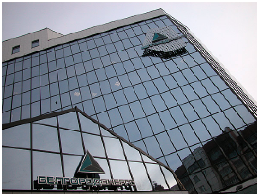
Facade of the 7 floor Belgorodenergo building in Moscow. Special glass minimises heat loss.

Bessenveldstraat 5 B - 1831 Brussels-Diegem www.konnex.org