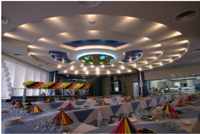
Restaurant for 50 persons with climate control and light scenes

▼ The KNX/EIB installations are spread over a surface of approximately 7500 m 2 and the following functions were realised: